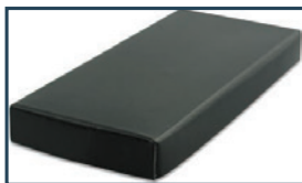
Gift Box Included with all metal keyholders