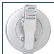
RBRM has alligator clip backing.