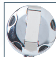
RBR5 has metal slip-clip backing.