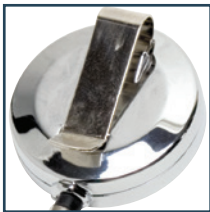
RBRM2 and RBRGM has metal slip-clip backing.