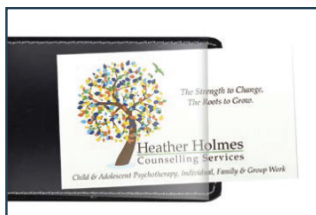
ID Panel Window on backside