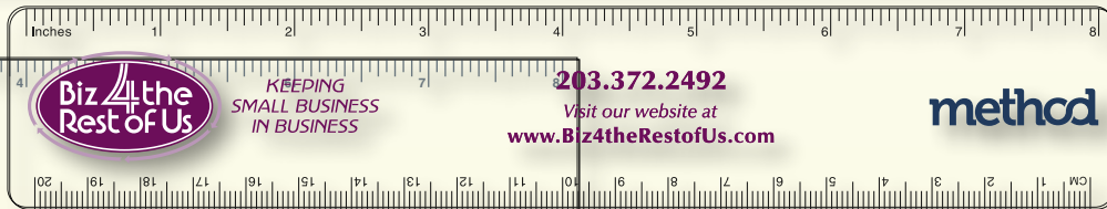
CR6R 1.5" x 8.25" Round corners