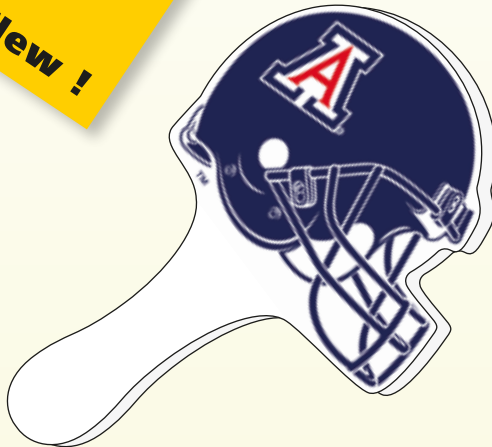
RPC3R-4CP Custom Shape