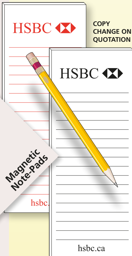
MNP2 2.75" x 7"