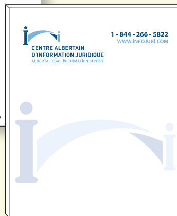
1.800.361.6673 MNP1-K 3.5" x 4.25" Standard Black