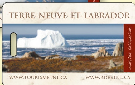
LFLLT1H 2.125" x 3.375" Horizontal Flip