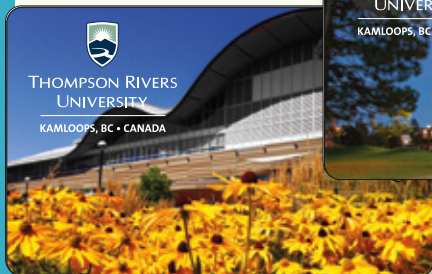
LFLLT1H 2.125" x 3.375" Horizontal Flip