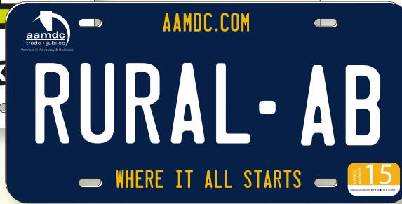
LP1 6" x 12"