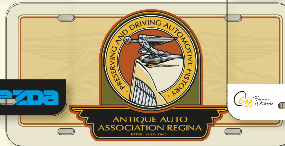
LP3R-4CP 6" x 12" Clear Polytrans