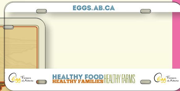
LP3R-4CP 6" x 12" Clear Polytrans