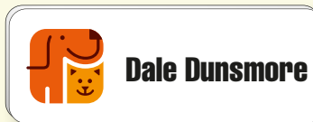
BGR 1 & BGR 1G 1" x 2.75"

CHOICE OF SURFACE OR SUB-SURFACE IMPRINT