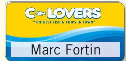
BGR 3 & BGR 3G 1.5" x 3"