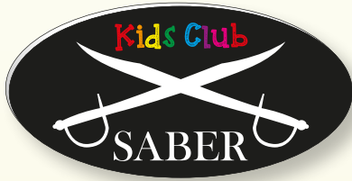
BGO 1 & BGO 1G 1.5" x 3"