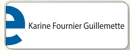
BGR 2 & BGR 2G 1.25" x 3.25"