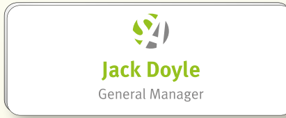
BGR 2 & BGR 2G 1.25" x 3.25"