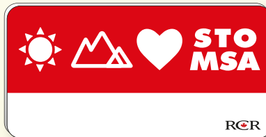
BGR 3 & BGR 3G 1.5" x 3"