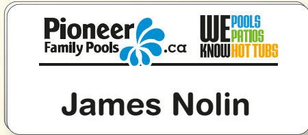
BGR 4 & BGR 4G 1.5" x 3.5"