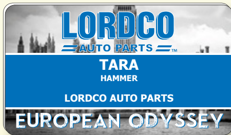
BGR 6 & BGR 6G 2" x 3.5"